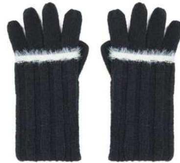
MULTIWEAR - LONGLINE

AVAILABLE IN: Black, Green Photographed in Black