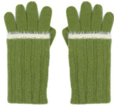
MULTIWEAR - LONGLINE

AVAILABLE IN: Black, Green Photographed in Green